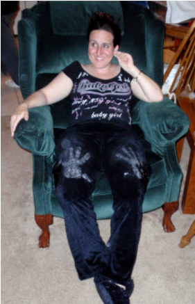
Cat (with giant flour hand- prints on her legs.)

"When did the Trimarian army start using blow guns?"